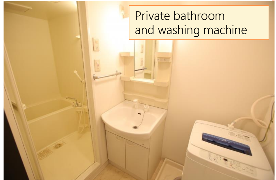
Private bathroom and washing machine